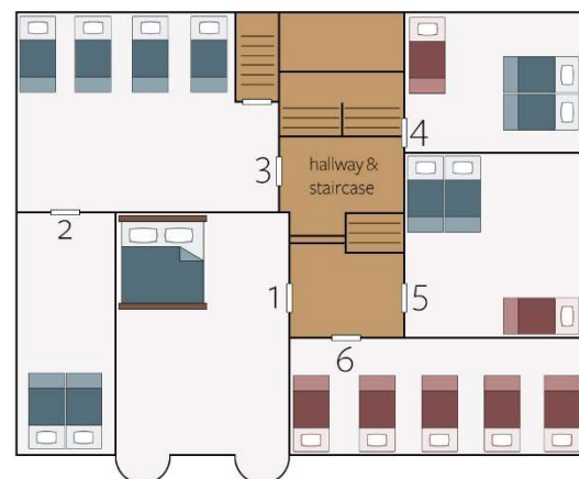
Blue beds are the standard layout, red beds are possible extras